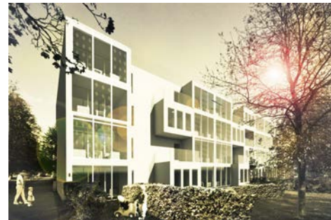
Fig 2-3: Transformation (Design by Antoniou, P., Ochwat, A., Schnotale, G.)